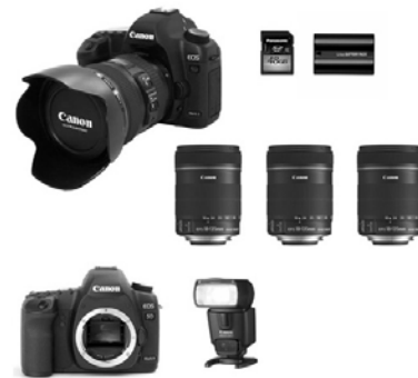
Application example for Digi-Shot L: DSLR camera with zoom lens, one further housing, three further lenses, battery and memory card (contents not included)